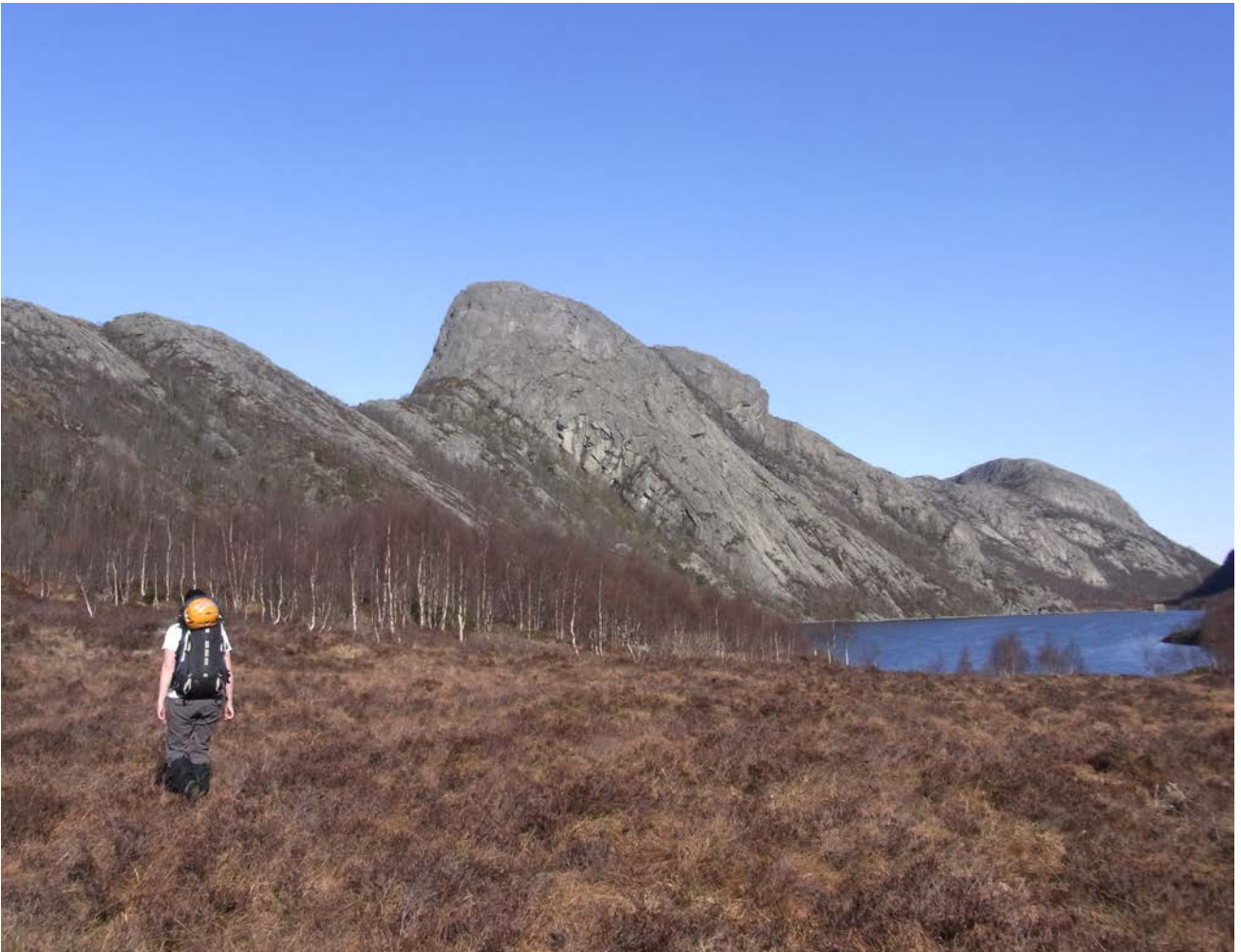
↑ The approach to Kjørkjestafjellet